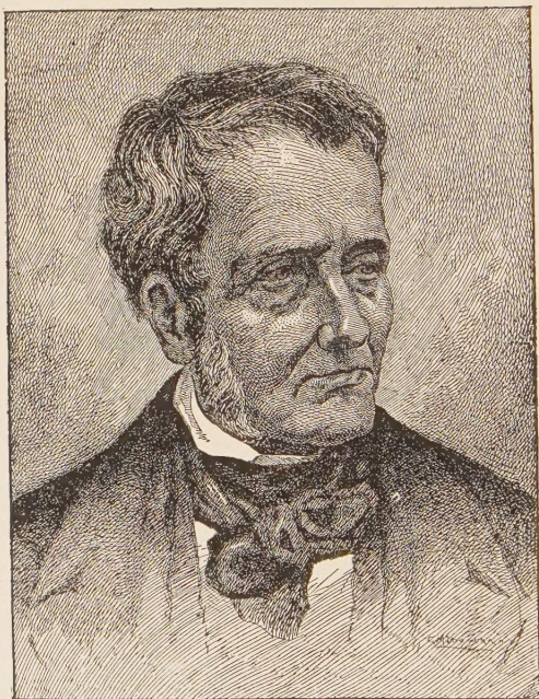
THOMAS DE QUINCEY